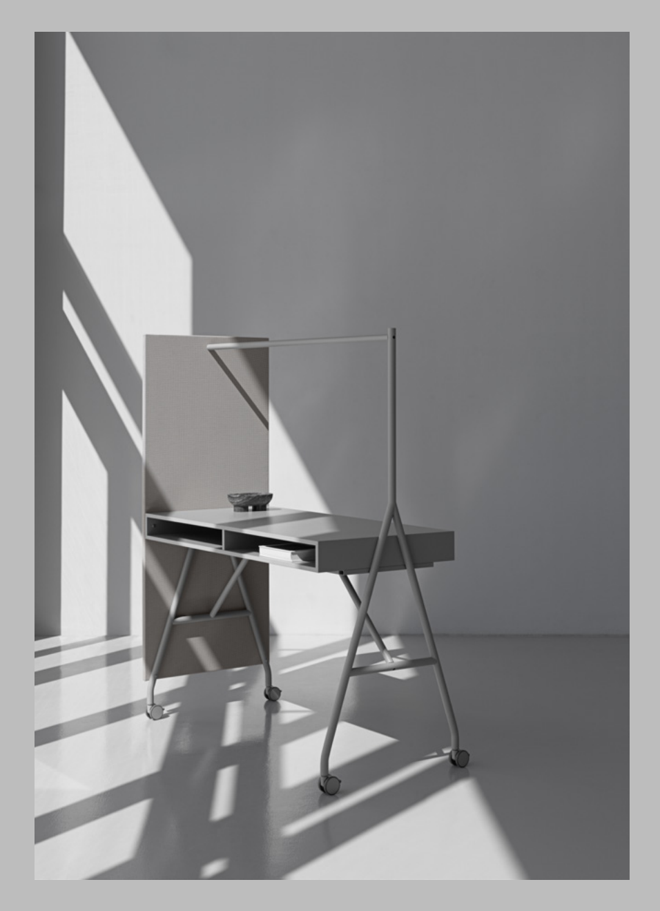
HANGOUT TABLE PRODUCT FACT SHEET