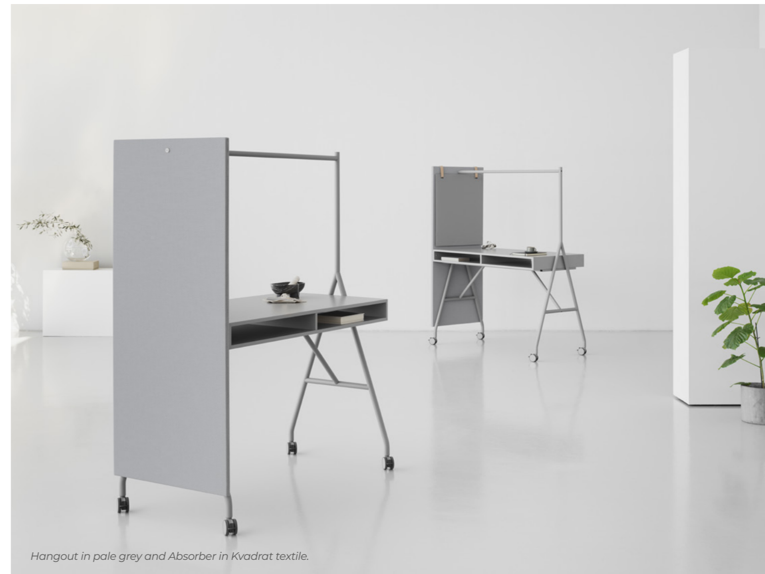
Hangout in pale grey and Absorber in Kvadrat textile.