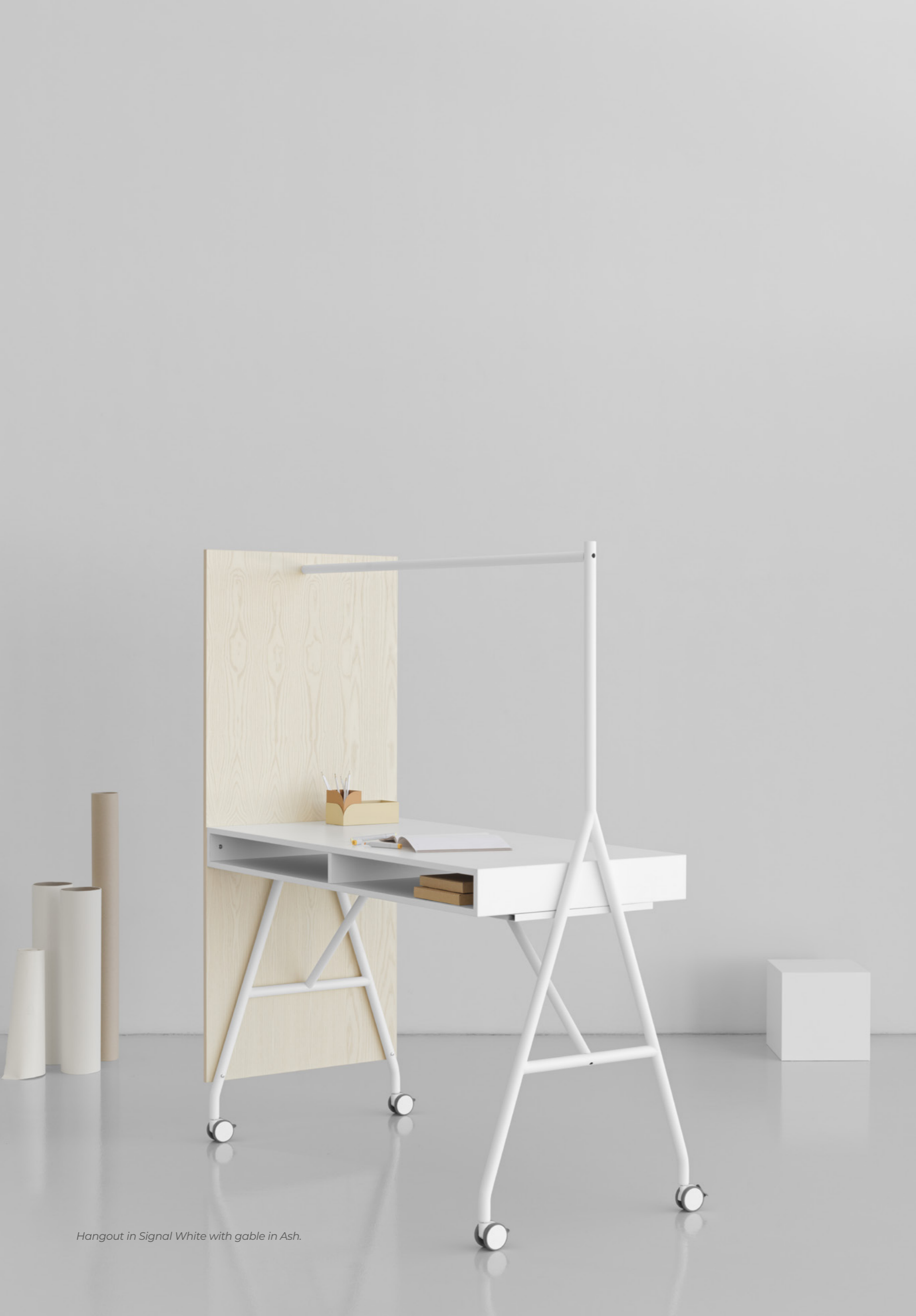
Hangout in Signal White with gable in Ash.