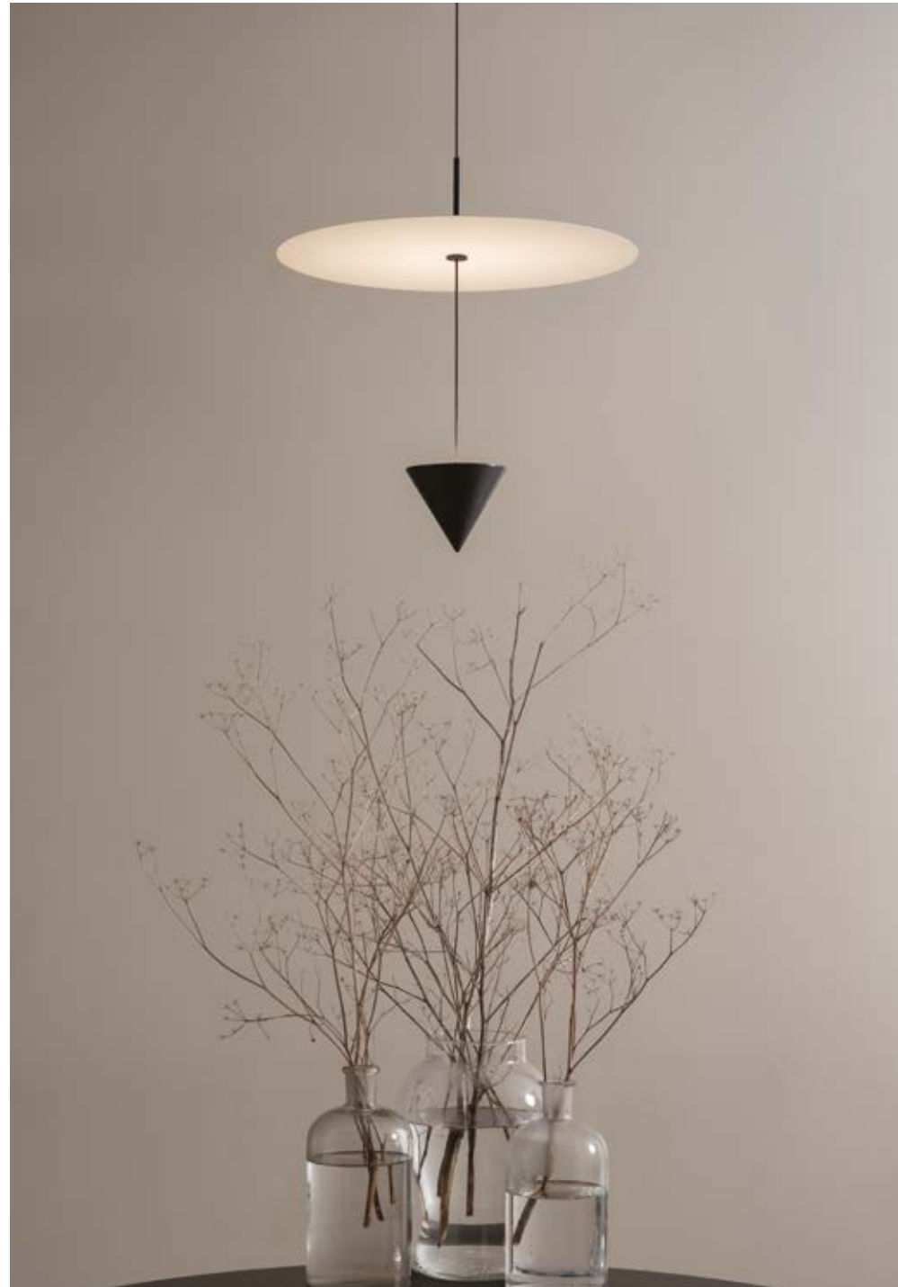
STRALUNATA design matteo ugolini