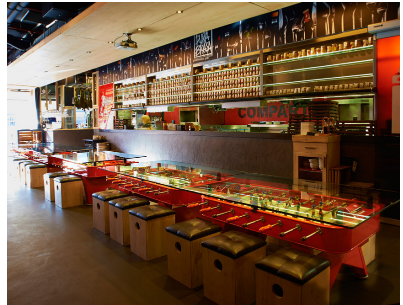
- pura brasa restaurant (barcelona) -