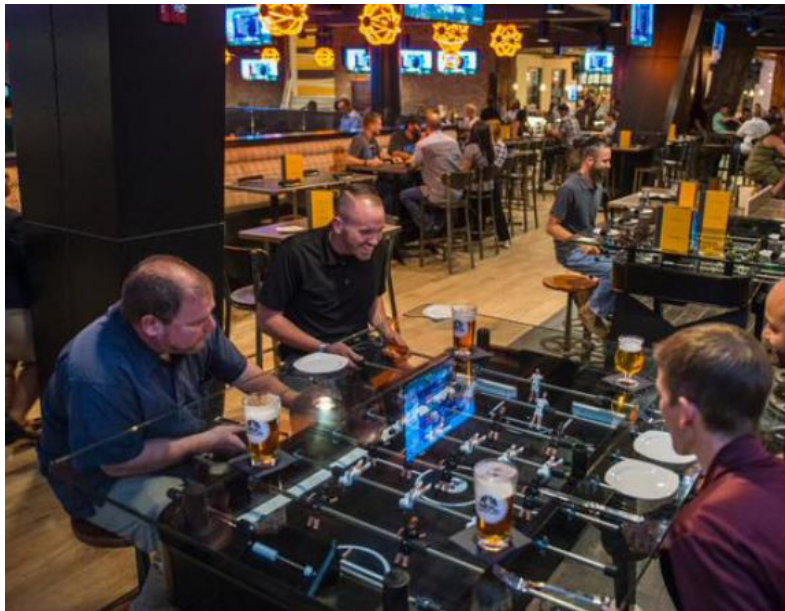
- NBC Sports restaurant (US) -