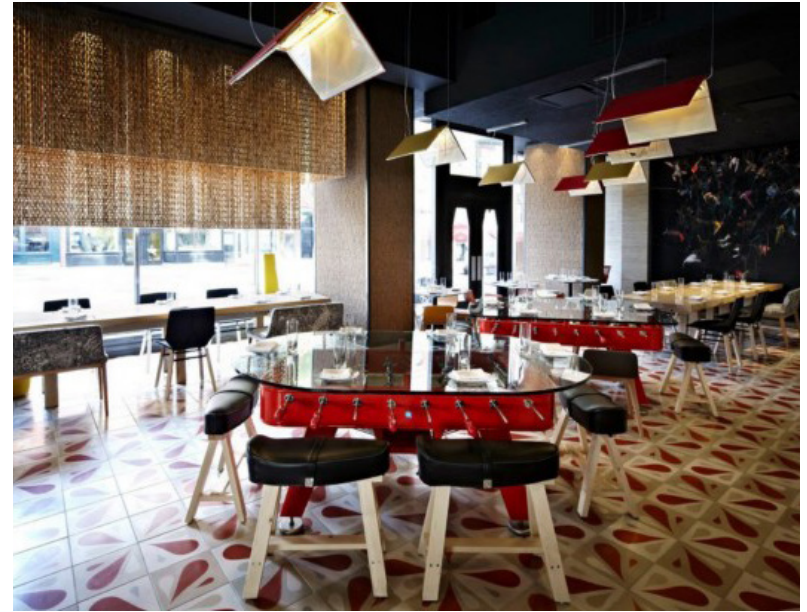
- jaleo restaurant (washington) -