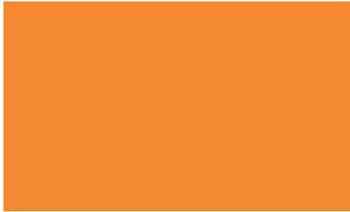
ARANCIO RAL 2004