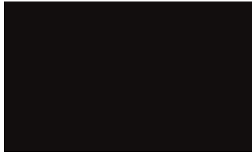
MOKA RAL 8022