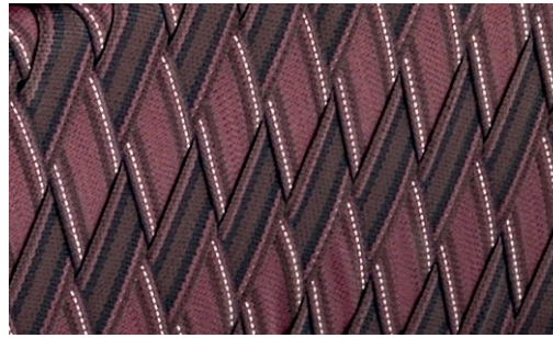
KENTE MULTICOLOR BROWN