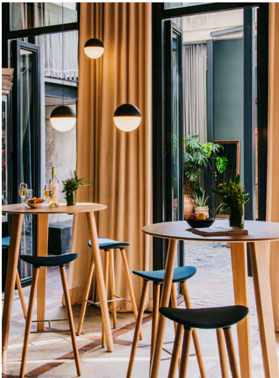
High table LTS System (ref. 4977), in oak, Coma wood stool (ref. 2091) with oak legs and seat upholstered in Steep Melange 68158.

This table system is noteworthy in its ability to easily adapt to multiple requirements, creating a huge range of table layouts. It combines wooden legs with a robust metal structure to support the tops.