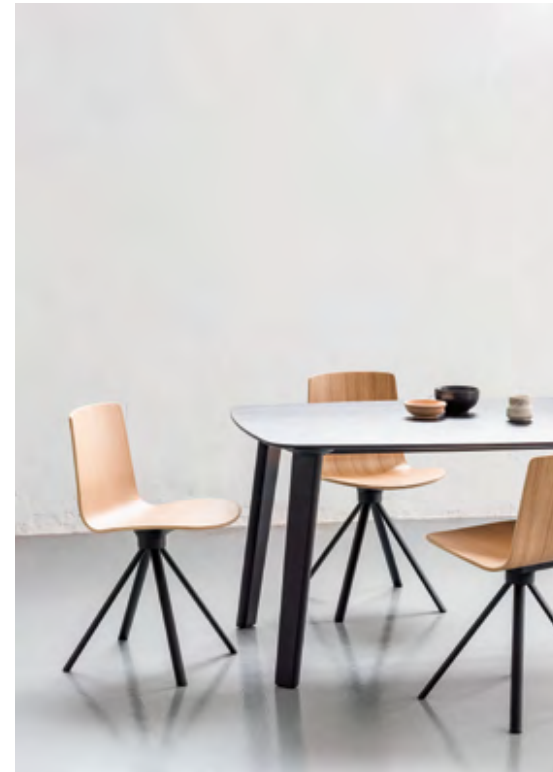
LTS System table (ref. 4972), in black oak legs and top with Lottus Spin chair (ref. 5843), lacquered in RAL 9006 and oak shell.

Con diversidad de alturas y opciones de acabado, LTS System ofrece distintas formas y dinámicas para crear espacios personales a medida.