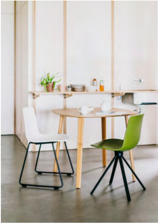
LTS System table (ref. 4974), in oak used with Lottus chair (ref. 4818 and ref.5843), lacquered in RAL 9005 and RAL 9016 and Pantone 5753C polipropylene shell.

On the right: LTS System table in natural birch structure and white HPL top, with Lottus chair (ref. 5500) lacquered structure and PP shell with upholstered pad.