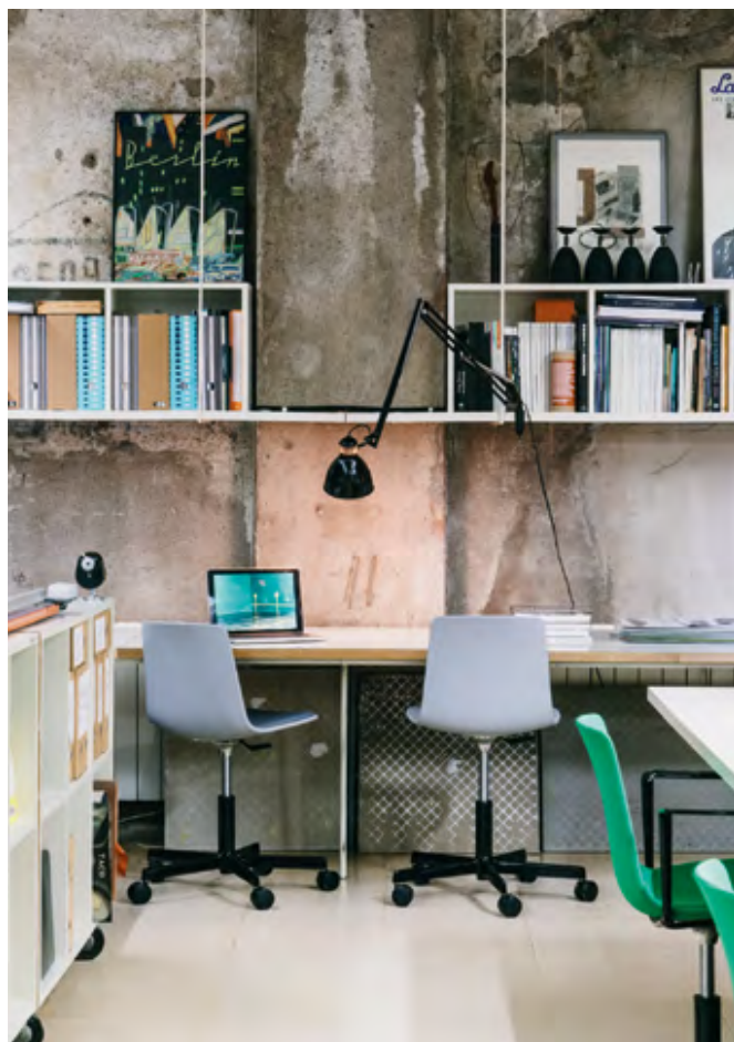
Lottus office chair (ref. 5309) in RAL 9005 structure, shell in RAL 7004 PP and pad upholstered in Step 60092. Lottus office chair (ref. 5300) with arms and base lacquered in RAL 9005 and fully upholstered seat.

Con su resistente base con ruedas, más adaptable al entorno de oficina, Lottus resulta ideal para los espacios de trabajo.