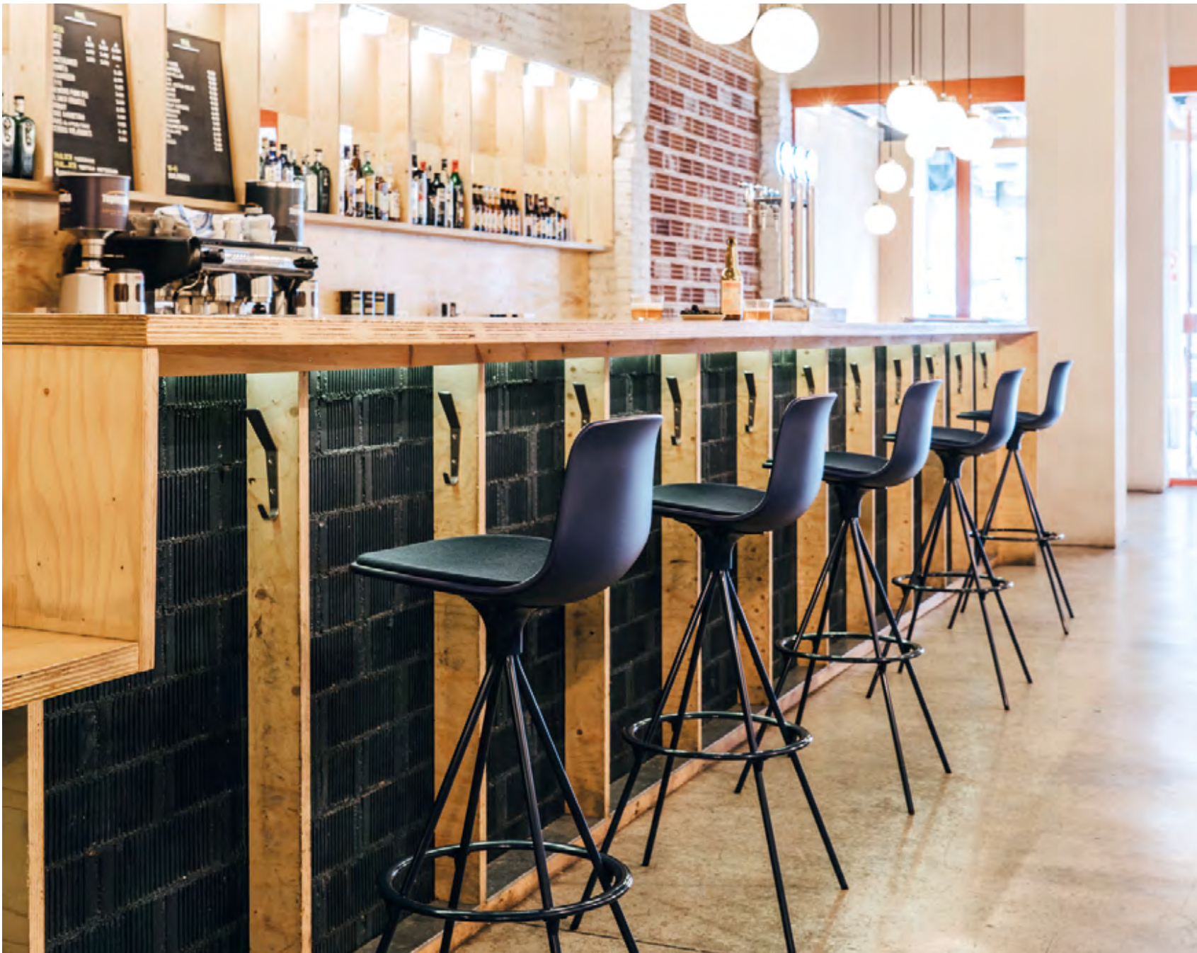
Lottus 4-legged stool (ref. 4750), shell in RAL 9005 polypropylene, upholstered pad in Fame 66071. Lacquered in RAL 9005.