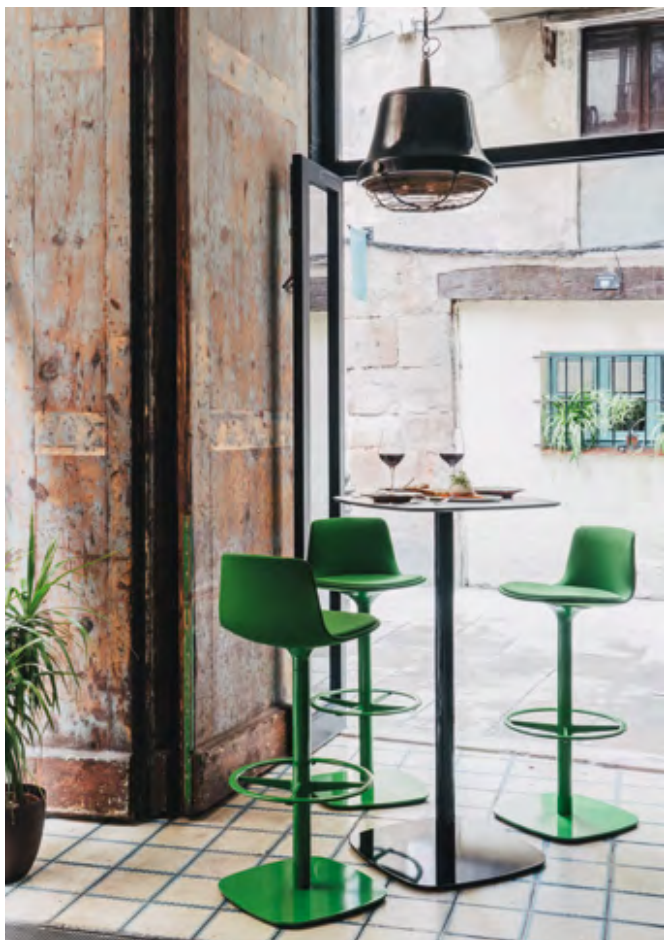
Lottus stool (ref. 4700) with a structure and PP shell in custom colour and pad upholstered with Lottus table.