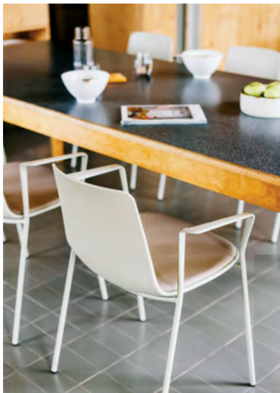
Lottus chair (ref. 5500) lacquered in RAL 7032, shell in RAL 7032 polypropylene and pad upholstered in Blazer CUZ47.

La línea sencilla y la esencia de Lottus se adaptan con estilo a los distintos espacios.