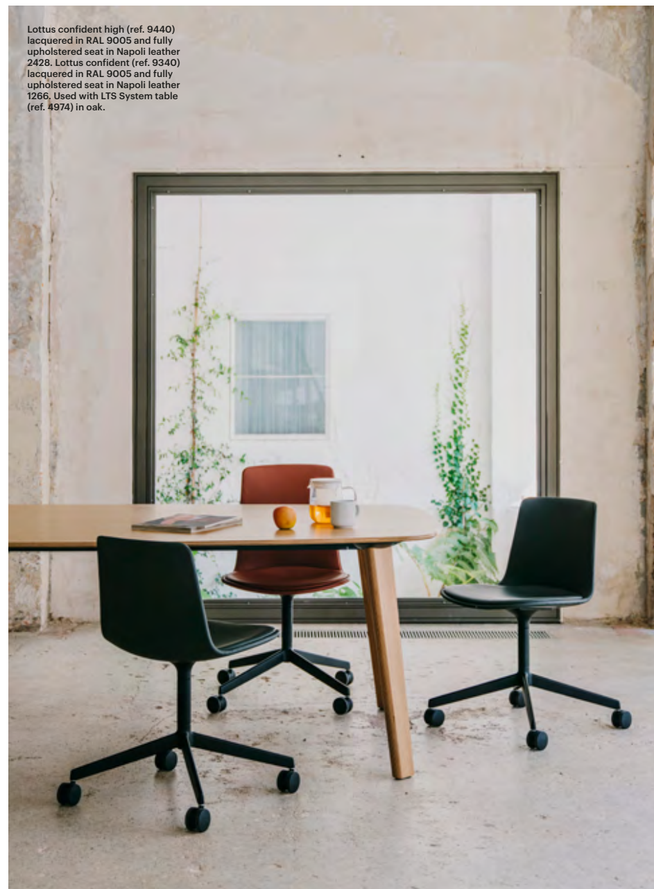
Lottus confident high (ref. 9440) lacquered in RAL 9005 and fully upholstered seat in Napoli leather 2428. Lottus confident (ref. 9340) lacquered in RAL 9005 and fully upholstered seat in Napoli leather 1266. Used with LTS System table (ref. 4974) in oak.