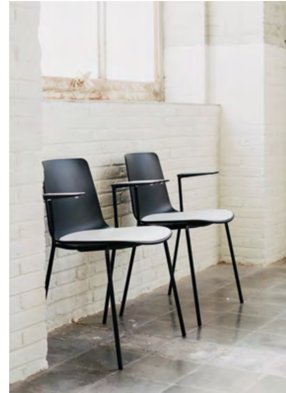
Lottus chair (ref. 4800) lacquered and PP shell in RAL 9005 with RAL 7004 pad.

Gracias a la amplia gama de materiales y acabados, Lottus es tan diversa como nuestros clientes.