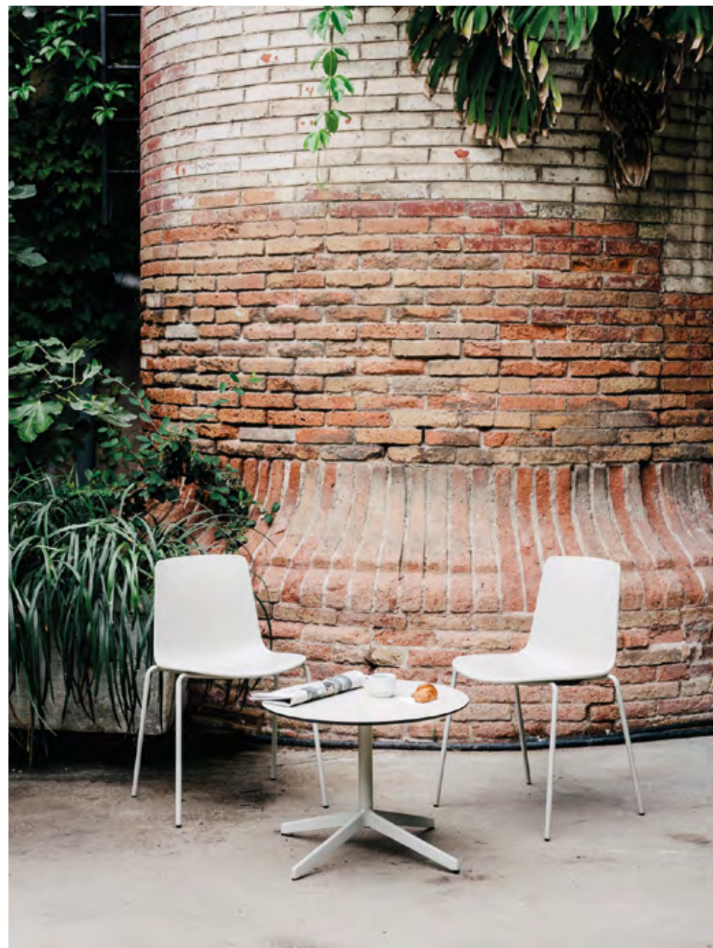
Lottus chair (ref. 4801) in monochrome RAL 7032 accompanied by the Lottus table (ref. 4941) with structure and special HPL top in RAL 7032.