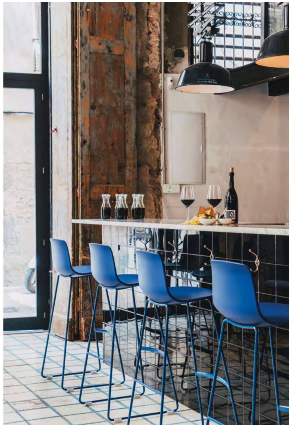
On the right: Lottus stool (ref. 4752) in Pantone 7545C monochrome.