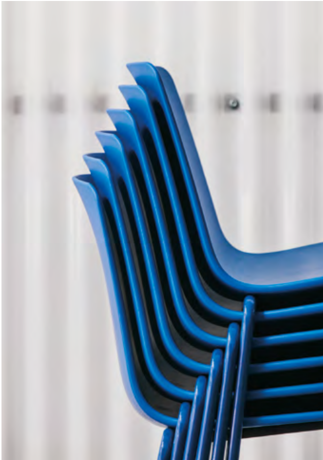
Lottus chair (ref. 4801) in custom monochrome colour.