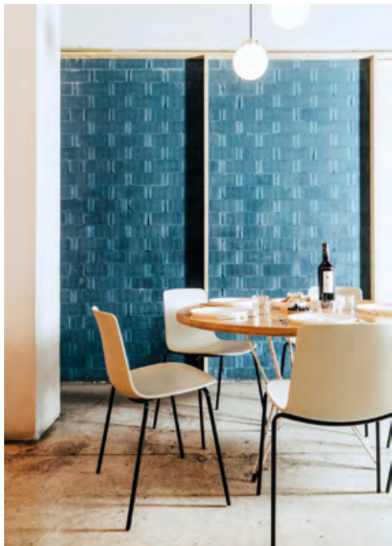
Lottus chair (ref. 4801) with RAL 7032 polypropylene shell and structure lacquered in RAL 9005.

Su curvatura natural, producto de la excelencia de su diseño, se ubica cómodamente entre la formalidad y el confort.