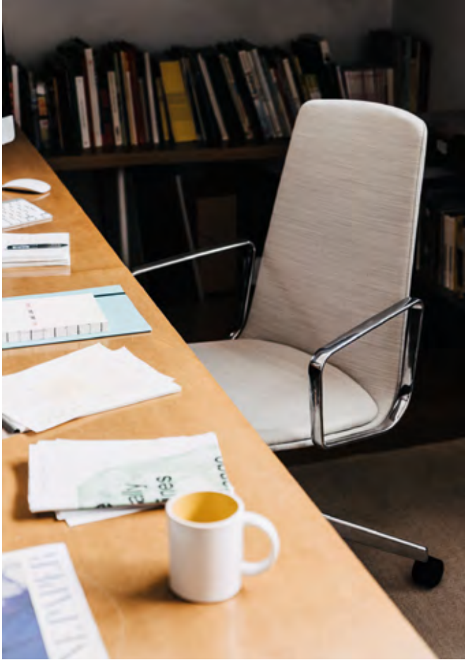
Lottus Conference (ref. 9064), with polished arms and base, fully upholstered in Crisp 4031.