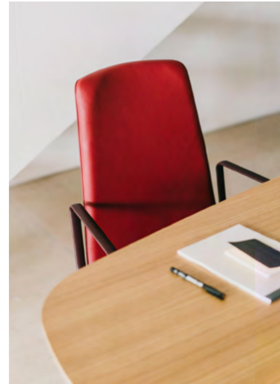
Lottus Conference (ref. 9071), lacquered in Pantone 4975C, fully upholstered in Napoli leather 4280 with LTS System table (ref. 4974) in oak.

Un toque de sofisticación y funcionalidad para las salas de reuniones y conferencias.